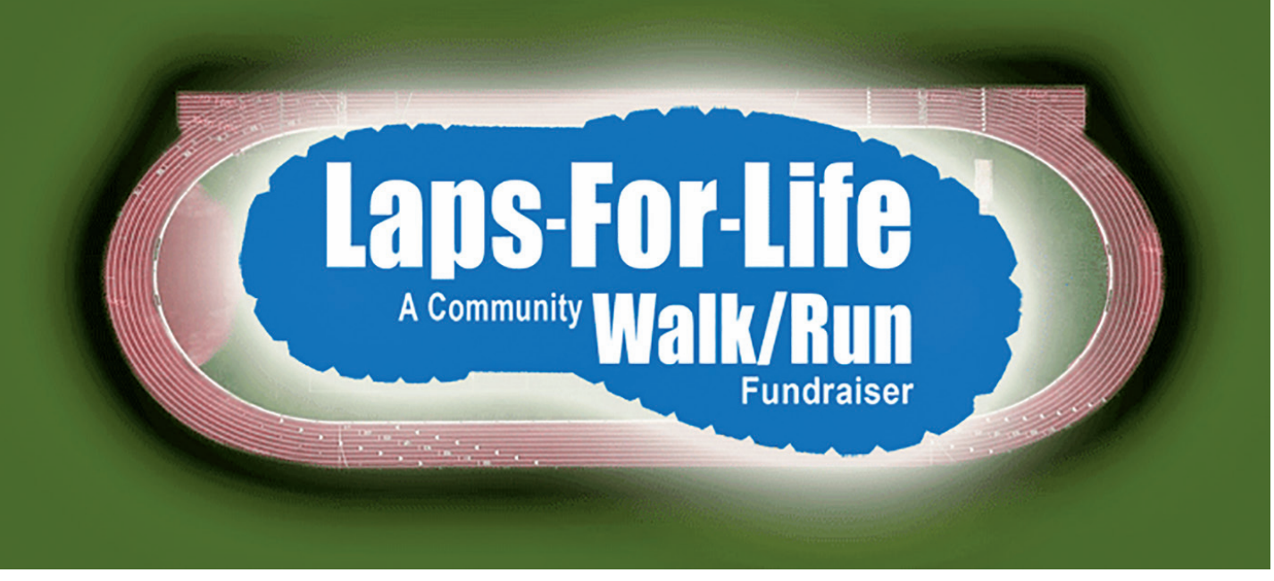
The Center Moriches Knights of Columbus will hold their first annual Laps for Life fundraiser to support Peconic Bay Medical Center.

The race gives people the option to walk or run, each with different goal distance levels. You could walk/run three, five, or seven miles, or choose a goal of your own.