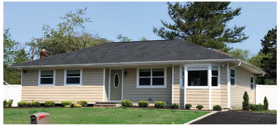
East Moriches—$439,900 Move right in! Newly renovated 3 bedroom, Newport Beach ranch with inground pool. Won't last!

East Moriches—$549,900 Spacious Newport Beach colonial with everything new! Inground pool, beach and boating rights too!