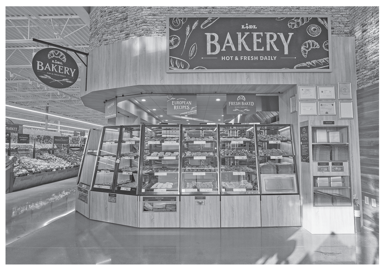
A preview of the bakery in a newly opened Lidl in Hagerstown, Md.

Lidl began in 1973 with their first store in Germany. Now, there are over 20,000 in 29 countries. The chain announced in May that it would also open stores in several other Northeast states, putting their total at over 100 U.S. stores, creating 1,000 jobs. ■