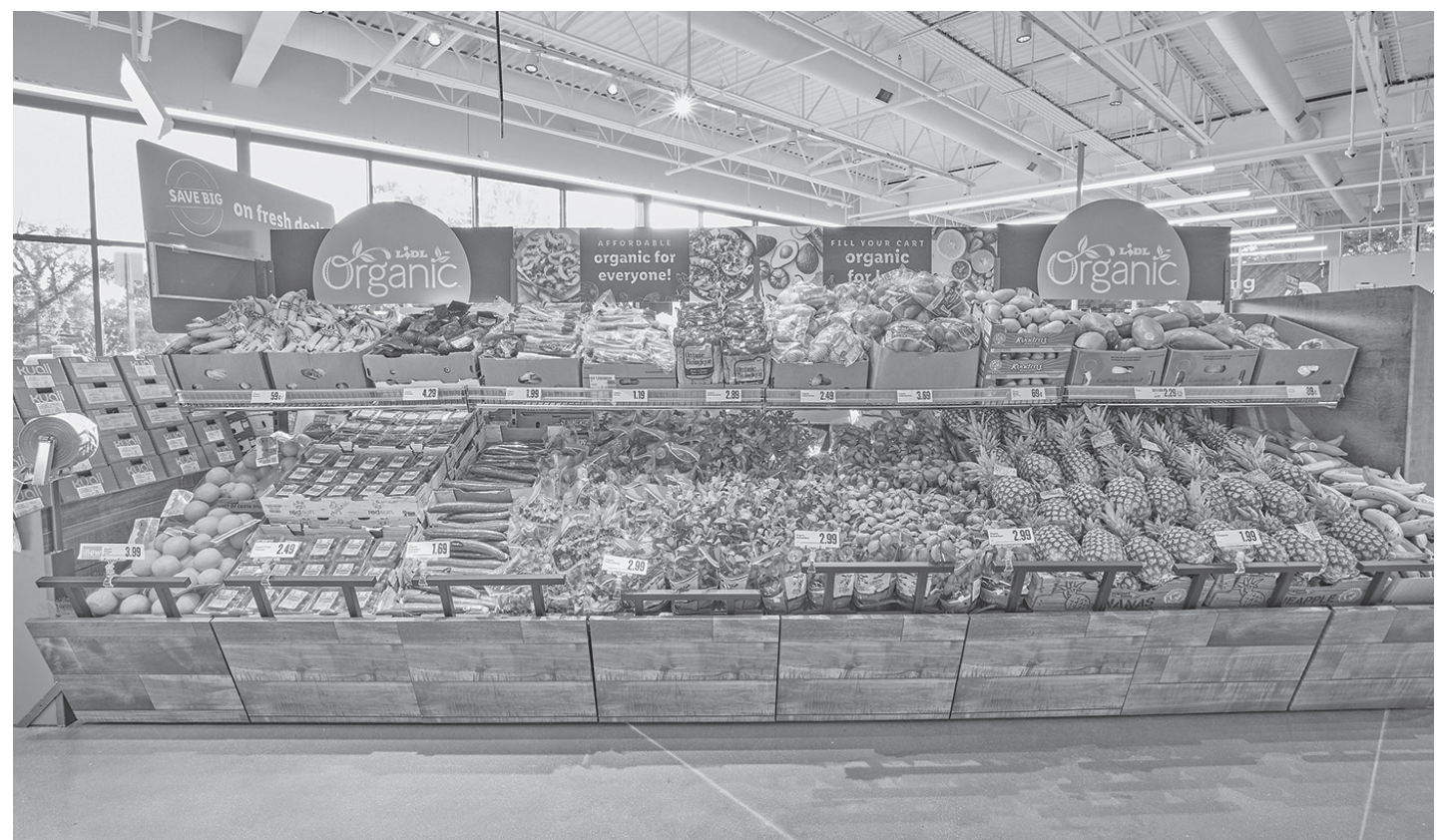
A preview of the produce section in a newly opened Lidl in Hagerstown, Md.