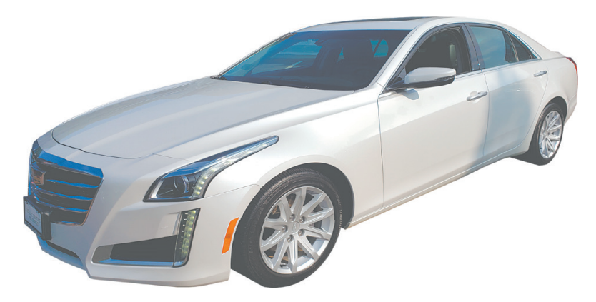
2016 Cadillac CTS Sedan AWD 2.0 4cyl, Navigation, XM, Sunroof, Heated/Cool Seats. 15,800 miles, STK# U6111 $30,995.00

2016 Cadillac ATS Sedan AWD 2.0 4cyl, Lux Pkg, Navigation, XM, Sunroof, Heated Seats. 15,750 miles, STK# U6139 $26,995.00