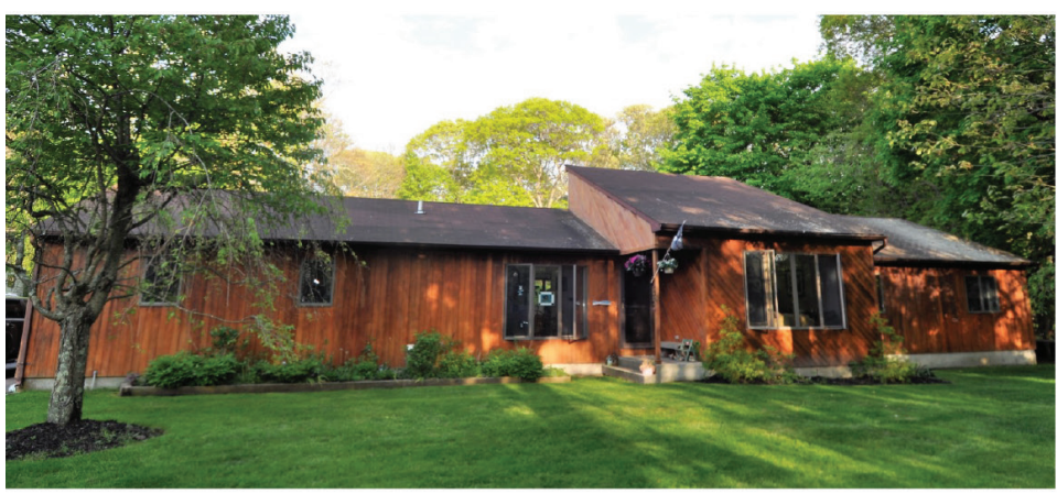
Center Moriches—$469,000 Sprawling 3 bedroom, 2.5 bath ranch. Private backyard with heated pool! Must see!

Center Moriches—$499,000 4 bedroom, 3 bath home has magnificent water views! Close to beach and boat launch.